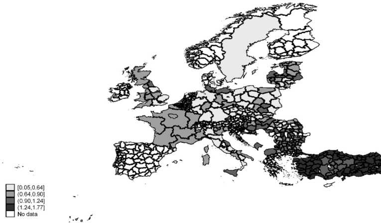
Figure 1 Households' Economic Hardship across European Regions

Note: Regional averages are calculated using LiTSII design weights.