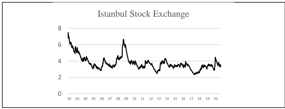
Figure 1: Representation of volatilities

Figure 1 shows the general characteristics of all the data. Each sub-figure indicates the volatility in the determinants over the analyzed period. Because of the 2008 global financial crisis, the VIX experienced a significant degree of volatility. During the COVID-19 pandemic, its volatility reached a new all-time high. This information demonstrates the widespread fear that had spread across the financial sector. These volatilities were also caused by the other global drivers. In 2008, the global crisis affected oil price volatility. By mid-2020, the increased volatility became apparent. During the 2008 financial crisis and the pandemic, the gold price was very volatile. This finding demonstrates that financial market turmoil reflects the volatility of global factors.